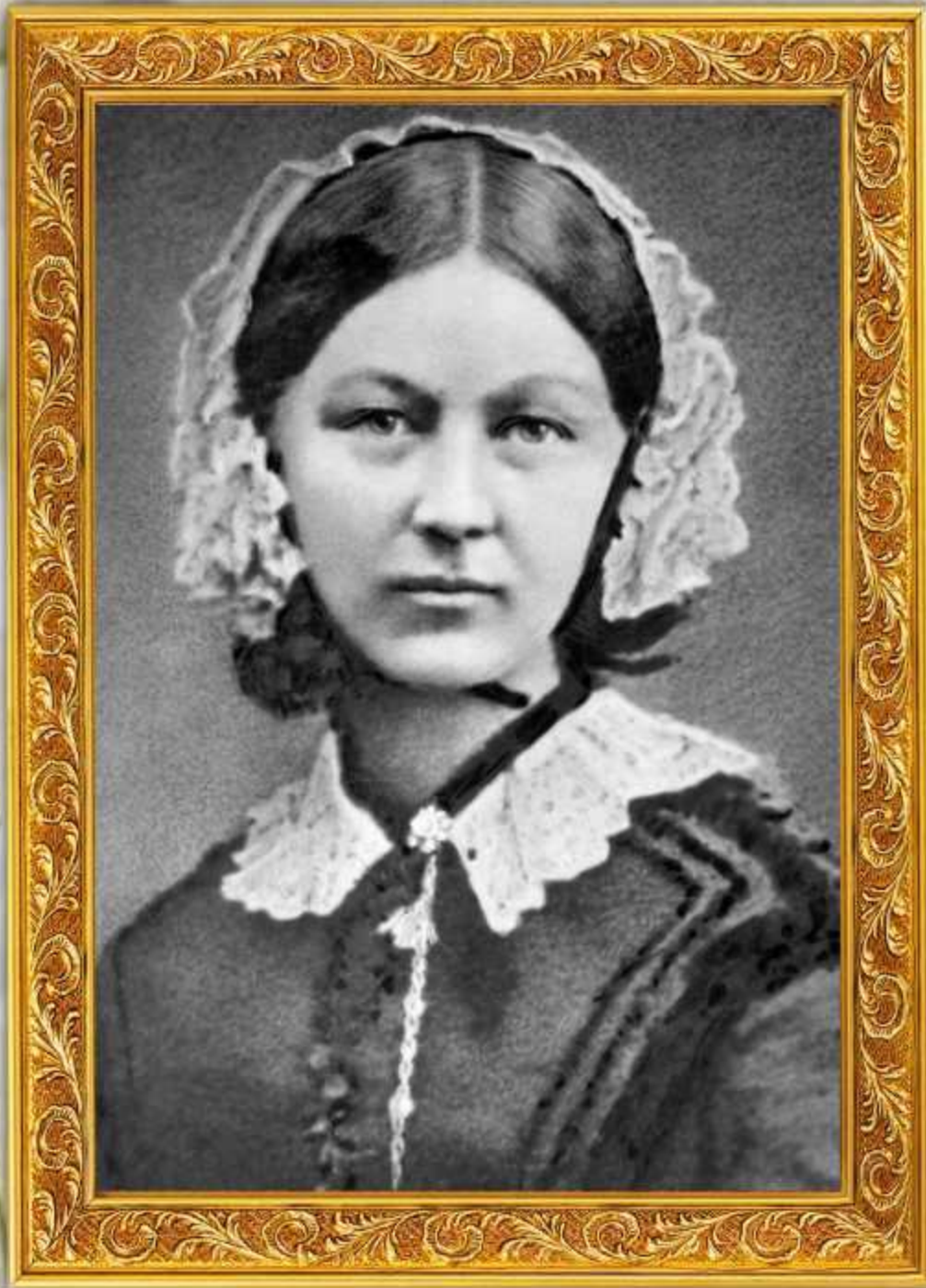
FOUNDER OF MODERN NURSING FLORENCE NIGHTINGALE (1820-1910)